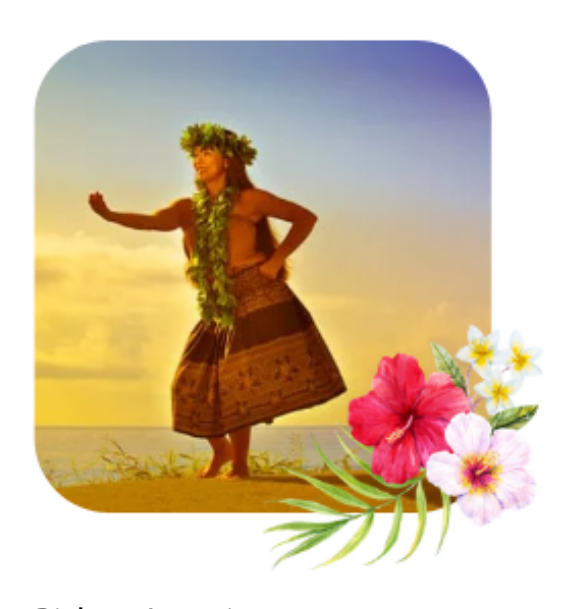
<u>Pick up Locations:</u> 9:30am - Black Bear Diner on Arden 10:00am - Belle Cooledge Library

Aloha! Get ready for a day full of fun, excitement, and island vibes at the historic Coal Sheds on the stunning Mare Island Waterfront Promenade! We're bringing a taste of Hawaii right to you with the Lei of Aloha Festival, an unforgettable celebration of Hawaiian culture. This family-friendly event is packed with live Hawaiian music, hula performances, and craft vendors to bring the magic of the islands to life. Enjoy delicious Hawaiian food, refreshing beer & wine, and browse unique crafts from local artisans. But wait, there's more! Make your own Lei of Aloha! Craft your very own lei—a symbol of love, affection, and good intentions—and become part of the tradition! Each flower you add represents Aloha—the spirit of kindness, unity, and patience. Wear your lei with pride as you soak in the warm, welcoming atmosphere of Hawaii right here in California. Enjoy lunch on your own. Merna's Hawaiian Kitchen will be serving up mouthwatering island favorites, so grab lunch from their Ohana-owned lunch wagon and enjoy the true taste of Hawaii. Register today to reserve your spot!