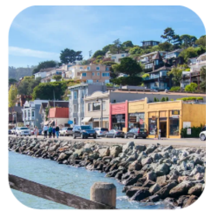
<u>Pick up Locations:</u> 7am - Black Bear Diner on Arden 7:30am - Belle Cooledge Library