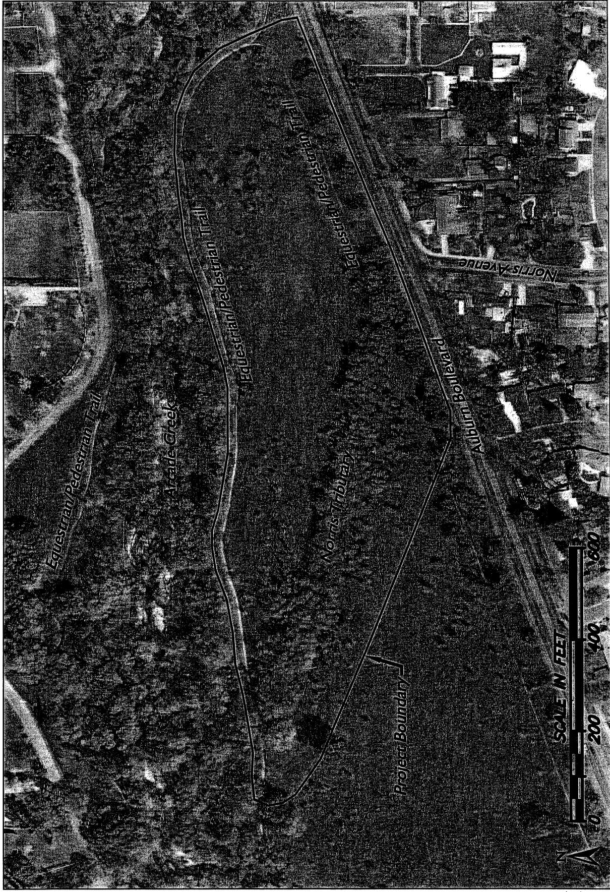
Figure 2 Project Site