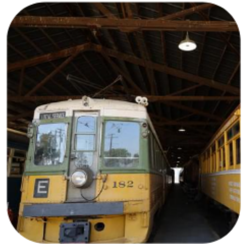
Trains at Western Railway Museum Suisun, California