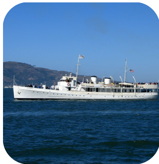
"The Presidential Yacht Potomac"